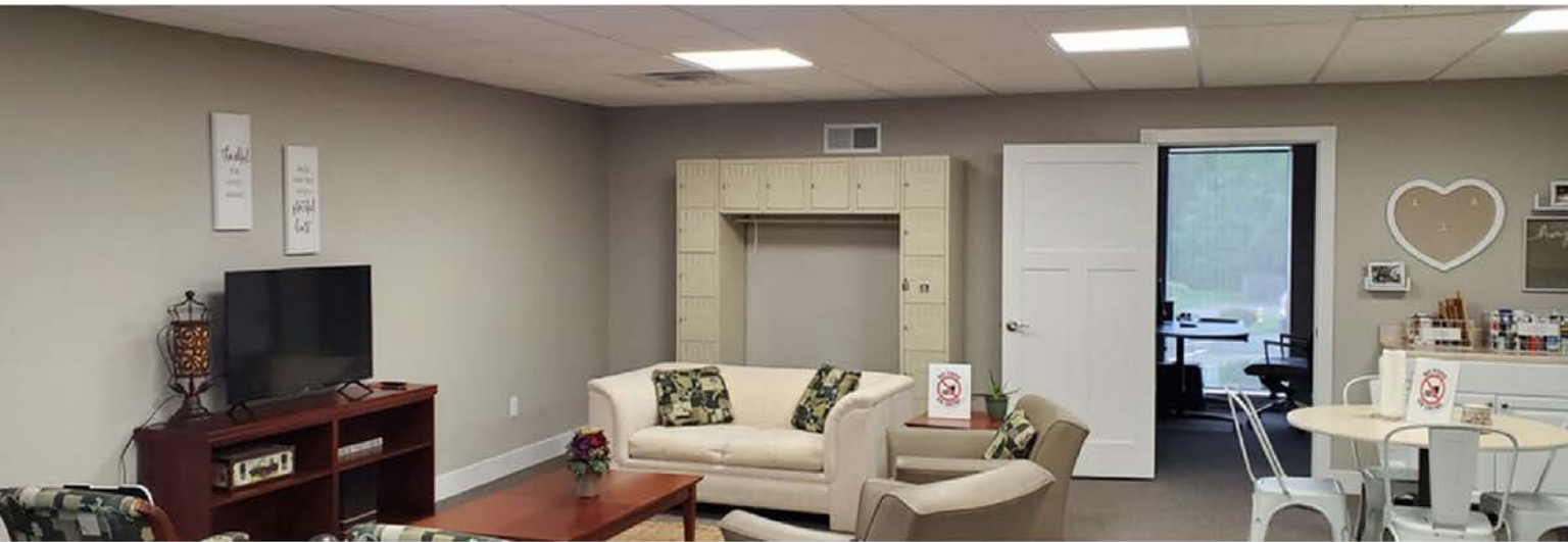
ANNIE'S OUTREACH CENTER – DELAWARE LOCATION

A nutritious lunch is served daily, and countywide transportation is offered free of charge.