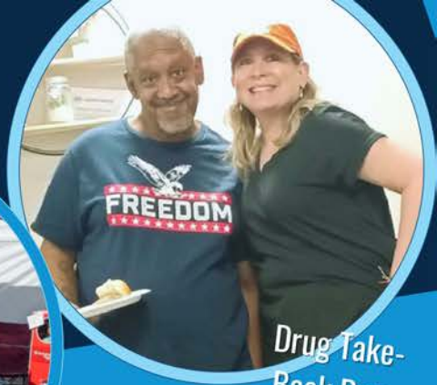
Drug Take-Back Days