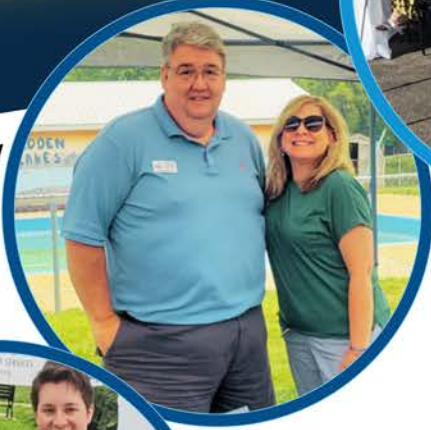
Community Health Fairs